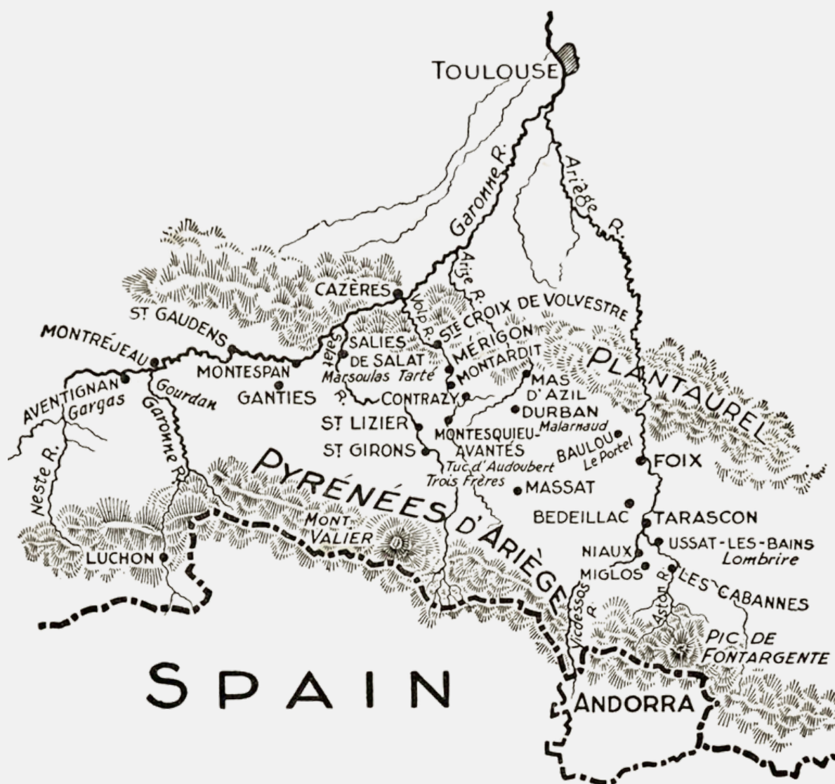
THE CAVE REGION OF ARIÈGE